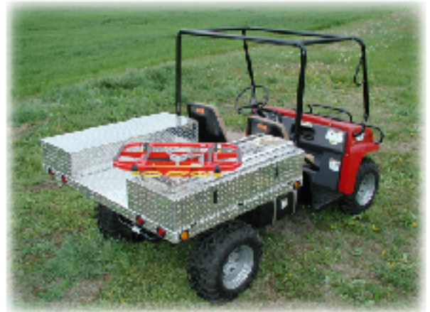
Shown on the Land Pride Treker ®

Through the use of our unique single point ratchet mechanism, locking the backboard to the carrier is accomplished with four hooks which automatically position and secure the backboard to the vehicle.