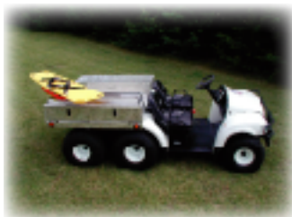
Rear / loading position