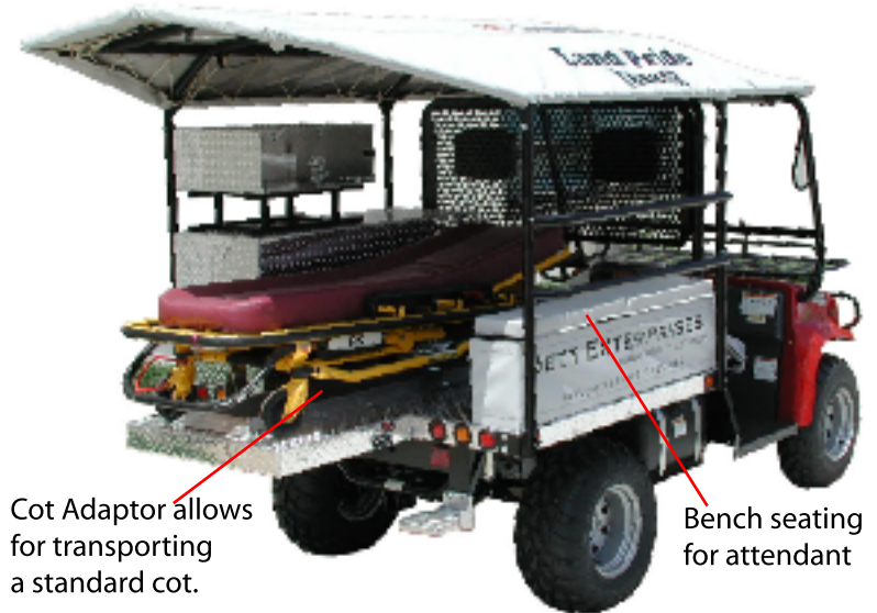
Shown on the Land Pride Treker®

The E-Muvr Ambulance package is a custom vehicle solution designed for emergency care in remote locations. A E-Muvr custom solution is assembled from stock components as well as custom fabricated pieces to meet a specific need.