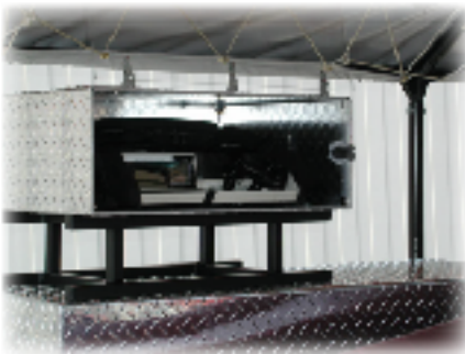
Defibrillator box features a clear fold-down lid for weather protection