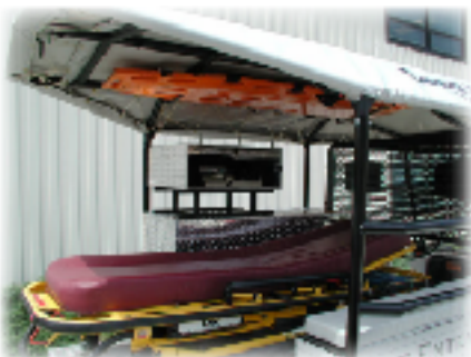
Canopy frame includes backboard storage rack for one 18" backboard

A few other purpose-built vehicle solutions: