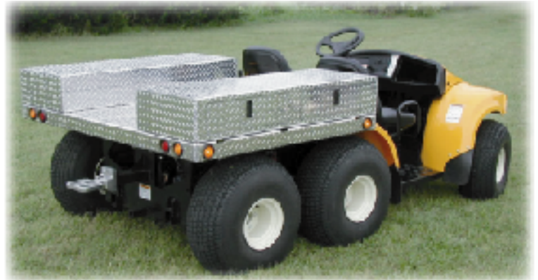
Shown on the MTD Big Country®

The E-Muvr Utility Box is a great way to protect valuable tools or equipment. It allows operators the ability to haul extra gear while keeping it safe, secure, and protected from the elements.