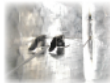
Quick Attach tiedown shown installed in Utility Box