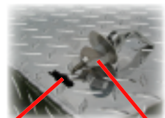
Knockout attachment opening Quick Attach Tiedown

Our quick attachment system achieves a tight connection by using a cam instead of bolts. This feature allows for easy installation and removal without any tools!